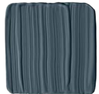
REFUGE SW 6228 Emerald Interior Acrylic Latex Paint Flat Sherwin-Williams