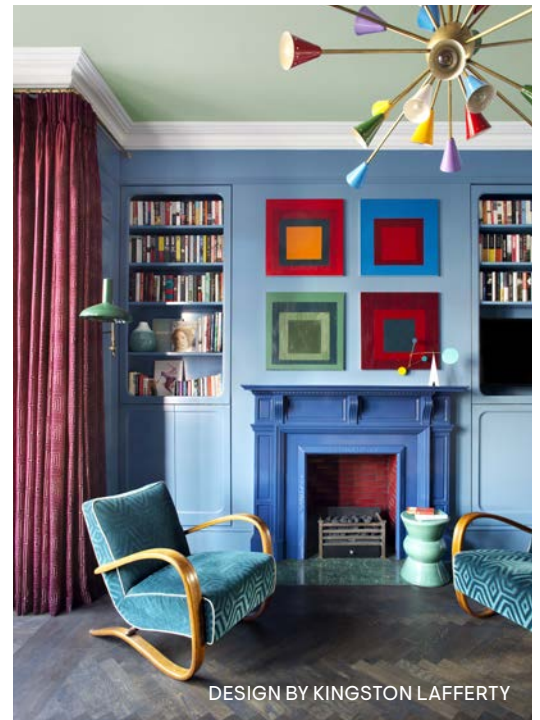
DESIGN BY KINGSTON LAFFERTY

“Don’t be afraid to use multiple colors in a space! People are scared that it will look too crazy or not cohesive, but I am obsessed.”