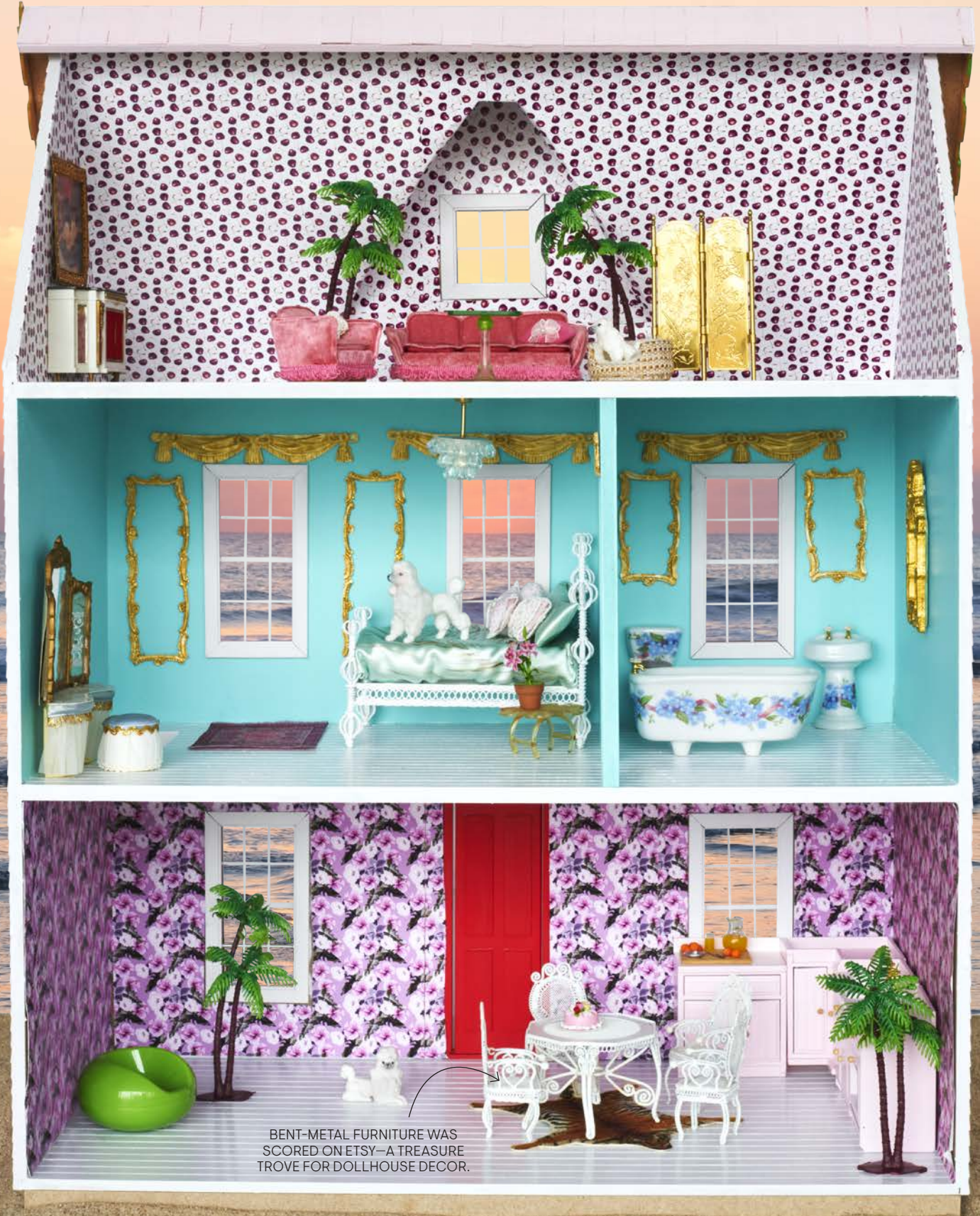
BENT-METAL FURNITURE WAS SCORED ON ETSY—A TREASURE TROVE FOR DOLLHOUSE DECOR.