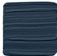
NIGHTSPOT C2-743 C2 Paint