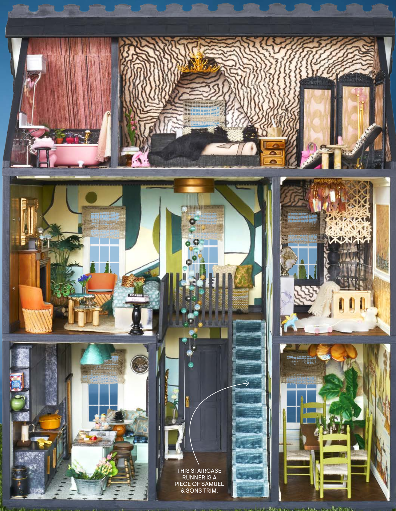
THIS STAIRCASE RUNNER IS A PIECE OF SAMUEL & SONS TRIM.