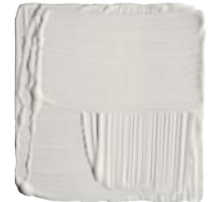
NOVEMBER RAIN 2142-60 Benjamin Moore