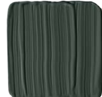
CURRENT MOOD Clare

The Movie Theater Theory: "You know when you leave a movie theater in the middle of the day and your eyes can't adjust? The same thing happens when you are in a light-filled room painted a dark color. Dark colors work amazingly well in dark rooms; bright rooms should be painted bright colors!" —Andrew Howard