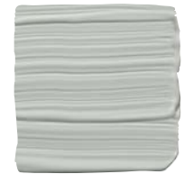
BROOK GREEN N410-2 Interior Matte Behr Marquee