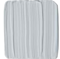
KEEPSAKES PPG1040-2 PPG