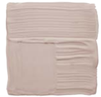
SETTING PLASTER NO. 231 Farrow & Ball