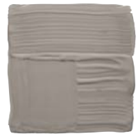
ELEPHANT'S BREATH NO. 229 Estate Emulsion Farrow & Ball