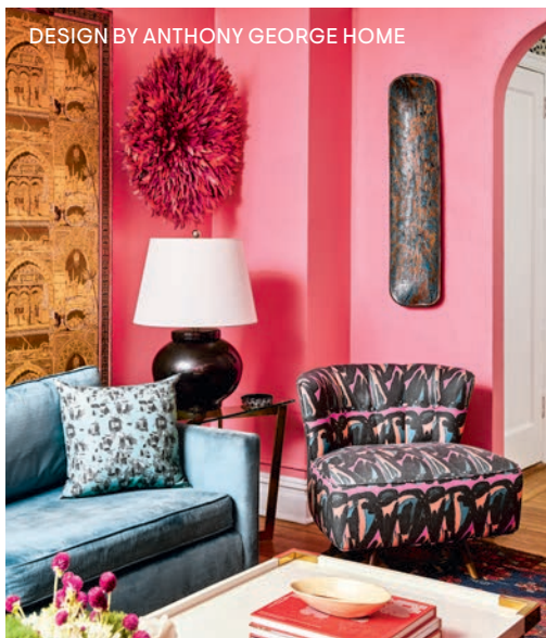
DESIGN BY ANTHONY GEORGE HOME