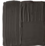
URBANE BRONZE SW 7048 Sherwin-Williams