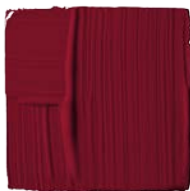
REMBRANDT RED 1002 Hollandlac Brilliant Fine Paints of Europe