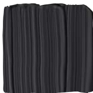
TOMCAT V114-3 Interior/Exterior High-Gloss Enamel Valspar