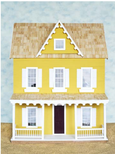
▲ Kelly Finley