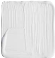
SUPER WHITE OC-152 Impervex Latex Enamel High Gloss Benjamin Moore